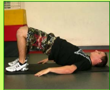
The Bridge strengthens the small stabilizing muscles of the spine.

Return to the start position and repeat for 2 sets of 10 repetitions.