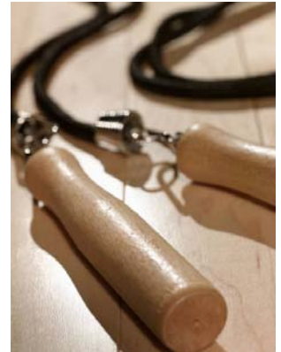
Getting FIT doesn't have to break the bank!