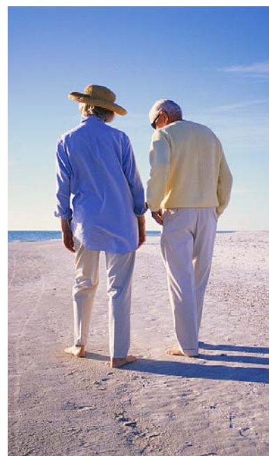
Regular walks can reduce the impact of arthritis.

Start with a minor change, such as taking regular 10 minute walks, and reduce the impact of arthritis on daily activities. Then, gradually introduce stretching and resistance based training into your program and begin to recognize the increased benefits of exercise.